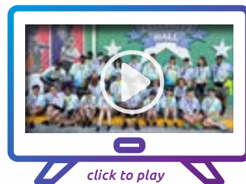
click to play